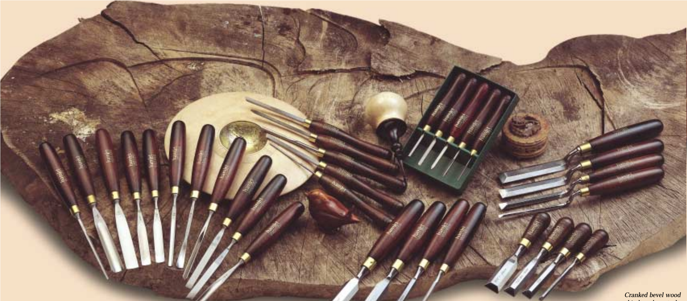
High quality carbon carving tools.