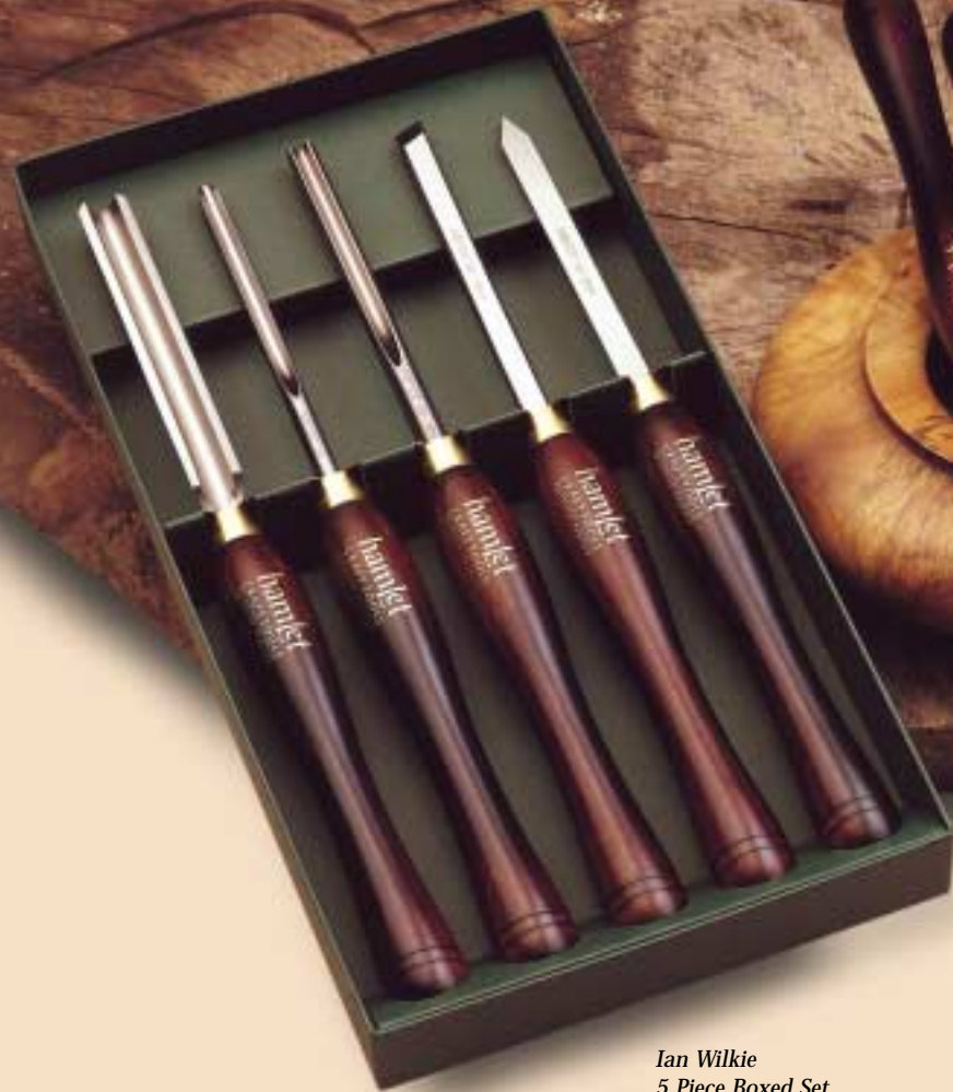
Ian Wilkie 5 Piece Boxed Set