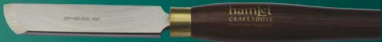
Alan Lacer Skew Chisels