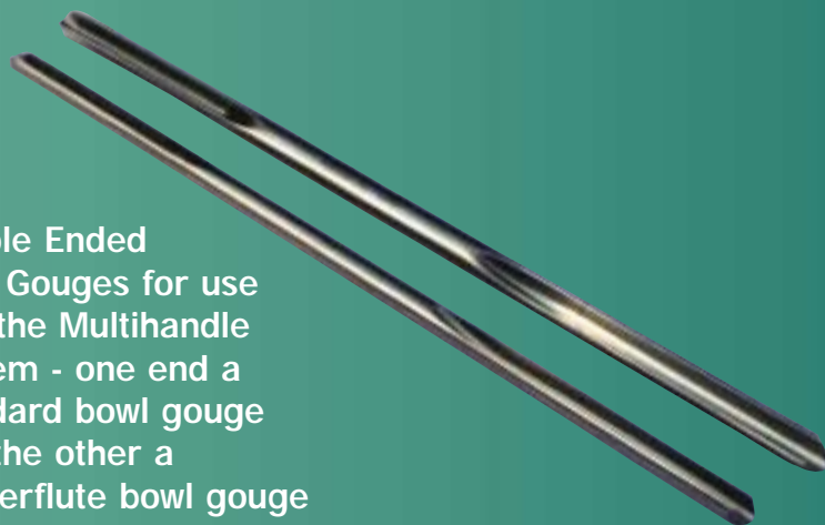
Double Ended Bowl Gouges for use with the Multihandle System - one end a standard bowl gouge and the other a masterflute bowl gouge