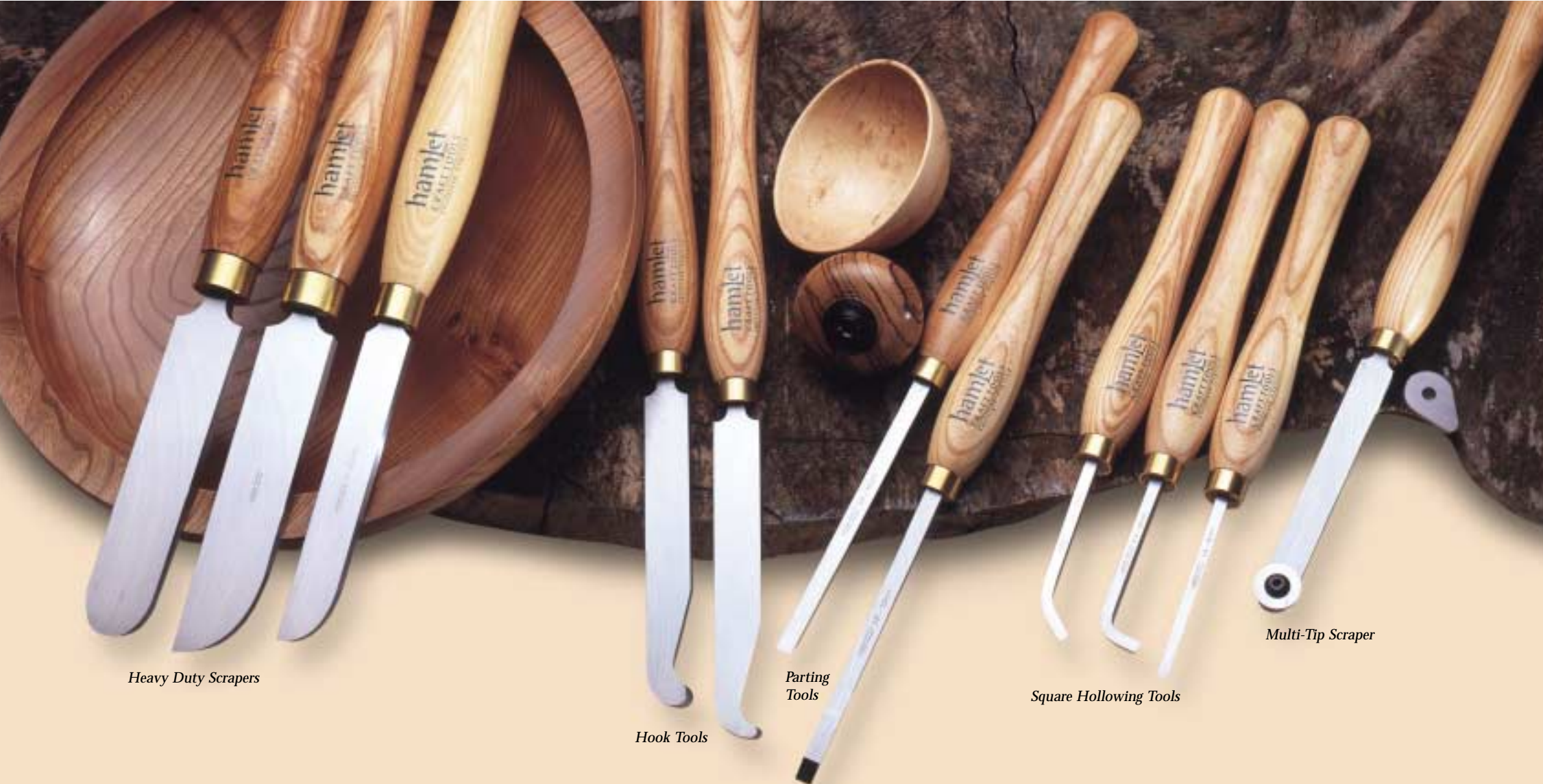
Heavy Duty Scrapers