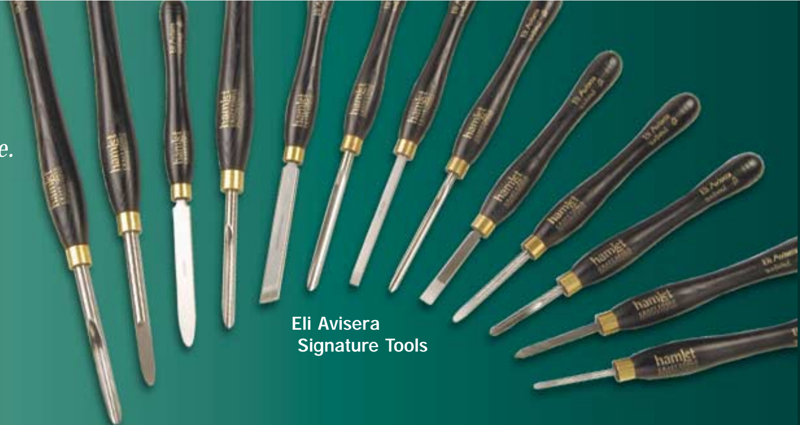
Eli Avisera Signature Tools

For full details of our range of tools please see our Product Price List or visit our website.